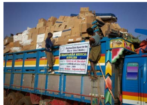
The Somalia shipments were funded by Life for Relief and Development.

Thanks to our volunteers' and donors' support, we have sent two containers to Somalia thus far in 2009. One shipment went to Abudwaq Hospital. This newly constructed hospital serves a community that has no medical facility in the city, with the nearest hospital being 120 miles away.