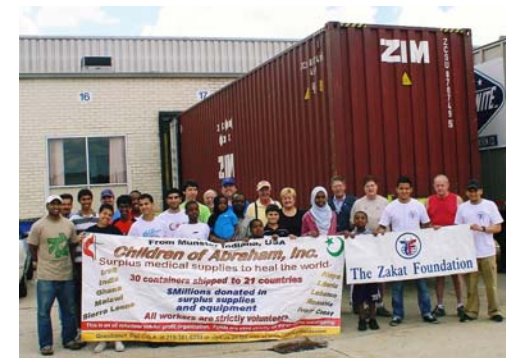
The Ghana shipment was loaded in July.

supports the immediate needs of long-term development projects that ensure individual and community growth.