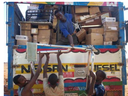
Our first shipment to Somalia was sent in March, followed by a second one in June.

The second shipment to Somalia was also arranged by ARAHA and funded by Life for Relief and Development. This shipment, sent in June, will be distributed to several medical facilities around the country.