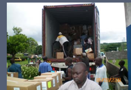
Shipments take weeks or months to get to their final destinations. Children of Abraham staff communicates throughout the process until we have confirmation of receipt.

Please send any questions that you have about Children of Abraham to info@coa-worldwide.org and we will answer them directly and possibly in future newsletters.