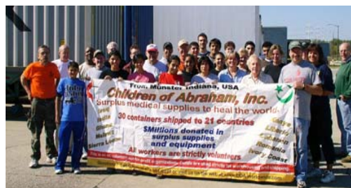
The Central American and Caribbean shipments were sent out in July and funded by Friends of the Orphans.

Central America and Caribbean We had two containers sent Dominican Republic, El Salvador, Guatemala, Haiti, Honduras and Nicaragua.